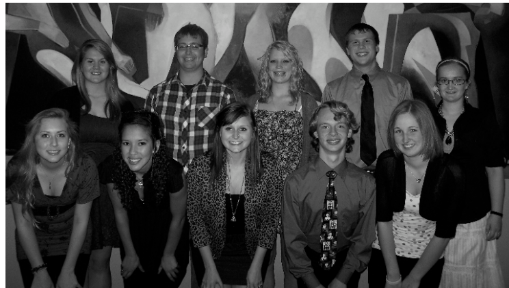
Above: The students who went to the All-State camp pose for a picture while at UNI.